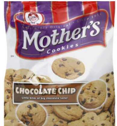
Mother's Chocolate Chip Cookies