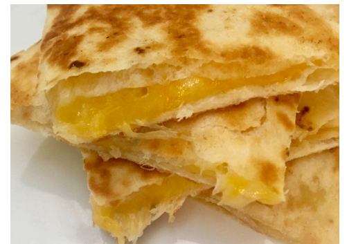
Plain Cheese Quesadilla - Stove Cooked