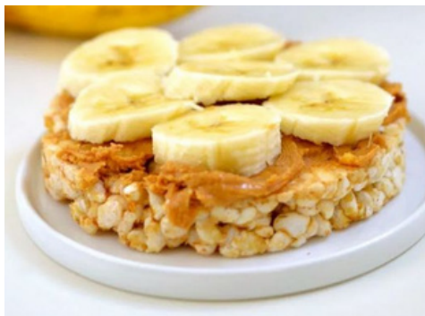
Peanut Butter & Banana on Rice Cake