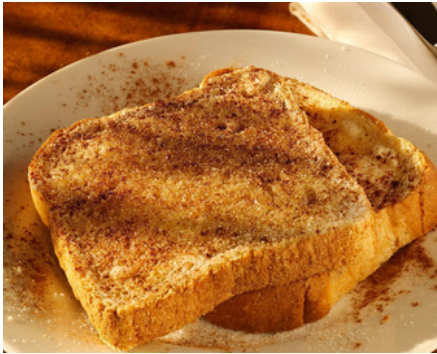
Cinamnon Toast with Brown Sugar & Butter

So, we asked ourselves, what are our favorite childhood snacks? As adults, we enjoy these still today - and have introduced them to our kids. We'll assume you know the recipes.