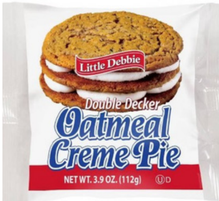
Oatmeal Cream Pie, a Little Debbie Delectable