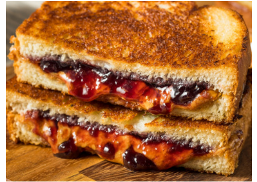
Toasted Peanut Butter & Jelly Sandwich